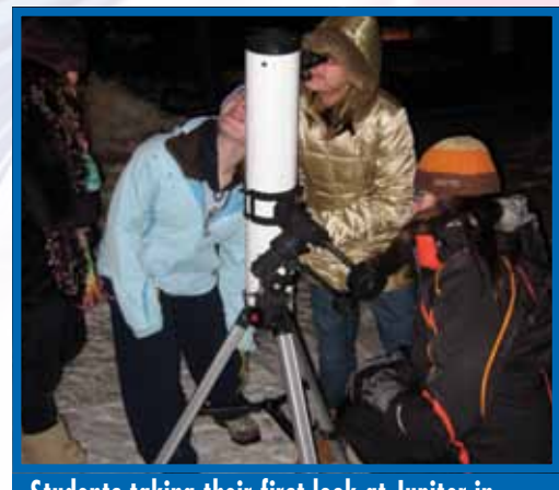
Students taking their first look at Jupiter in Explore Our Universe.