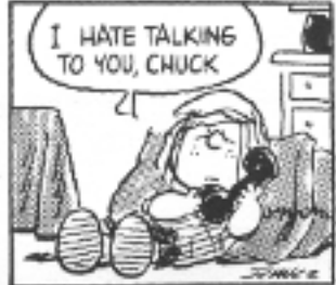
© February 13, 1992 United Feature Syndicate, Inc.